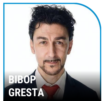
Co-Founder and Chairman of Hyperloop Transportation Technologie