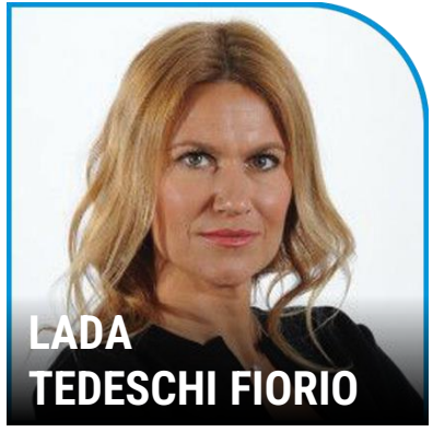
Vicepresident, Atlantic Grupa