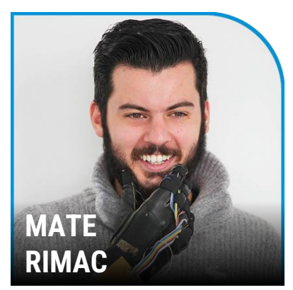
CEO at Rimac Automobili