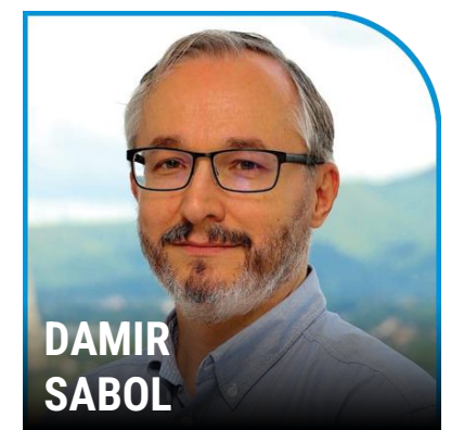
Founder and CEO at Photomath